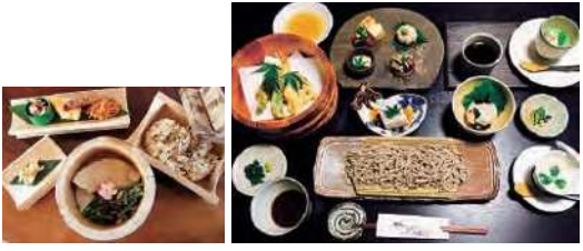
Dishes served in bamboo wares (at TAKeyA) ☎0944-62-5028

Hand-kneaded soba noodles (at Osoba Nanakusa) ☎0944-62-7622