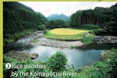
2 Rice paddies by the Komenotsu River