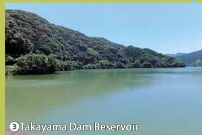
3 Takayama Dam Reservoir