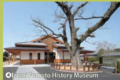
4 Izumi Fumoto History Museum