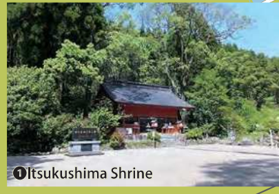
1 Itsukushima Shrine

Enjoy the sound of clear flowing water during a visit to rural regions