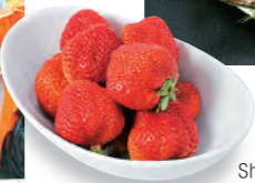
Shingu Town-the first place to produce strawberries in Fukuoka