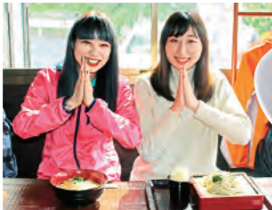
Fresh soba noodles Tachibana ☎070-2374-1234