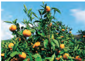
Tachibana Mikan, a fruit formerly dedicated to the Emperor