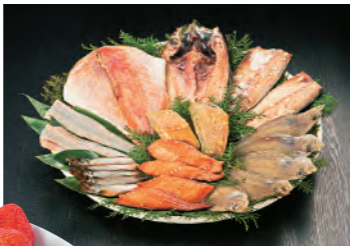
Many seafood shops near the beach for souvenir shopping