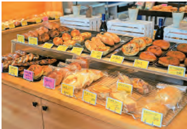
Ciel Blue ☎092-986-9197